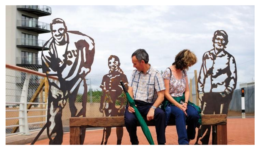
Portrait bench on Pont y Werin, on the Cardiff Bay Trail