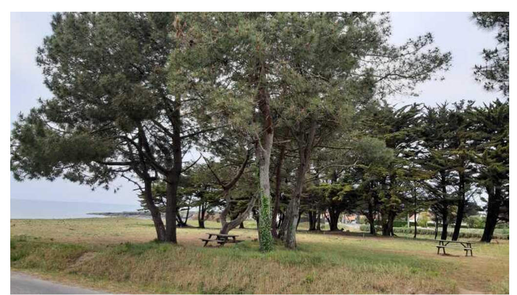
Picnic area of the Anse beach in Préfailles, France, along EuroVelo 1 – Atlantic Coast Route