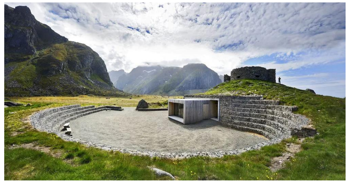
Rest Area in Eggum, Norway, by architect Snøhetta along the Scenic Route Lofoten along EuroVelo 1