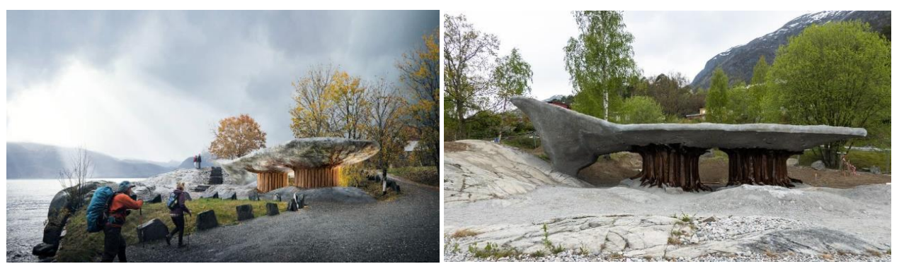
Rest area project by architect agency Helen & Hard in Tyrvefjøra, Norway along the Scenic route Hardanger © Visit Norway (picture 1) and final result © Lage Bakken, Statens vegvesen (picture 2)