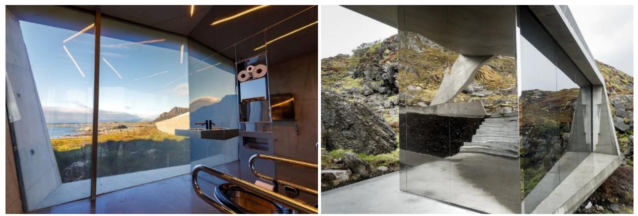
Toilets in Bukkekjerka, Norway, by architect Morfeus Arkitekter along the Scenic route Andøya (picture 1) and Stegastein (picture 2)

The Norwegian Road Administration decided to collaborate with Norwegian architects, as explained above. This resulted also in designing restrooms perfectly integrated with stunning landscapes, offering a basic service that can even be a tourist attraction in itself.<sup>11</sup>