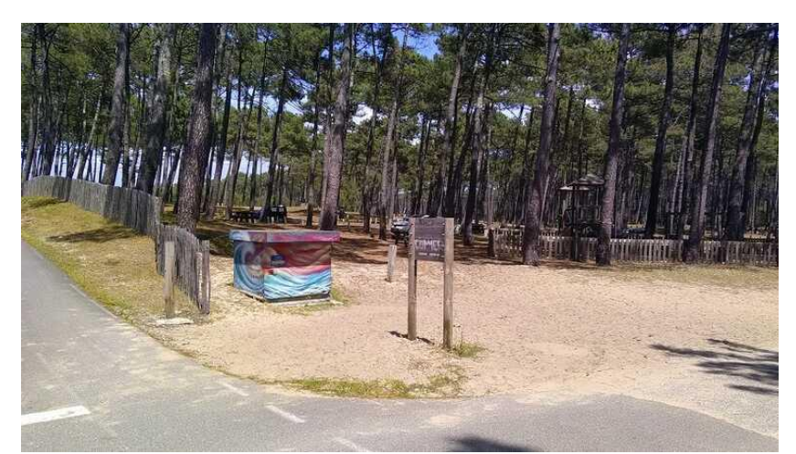
Rest area in Lespecier, France on EuroVelo 1 – Atlantic Coast Route