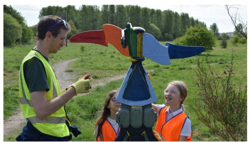
Since they have been set up the Millennium Mileposts have been looked after by volunteers from Sustrans and local communities