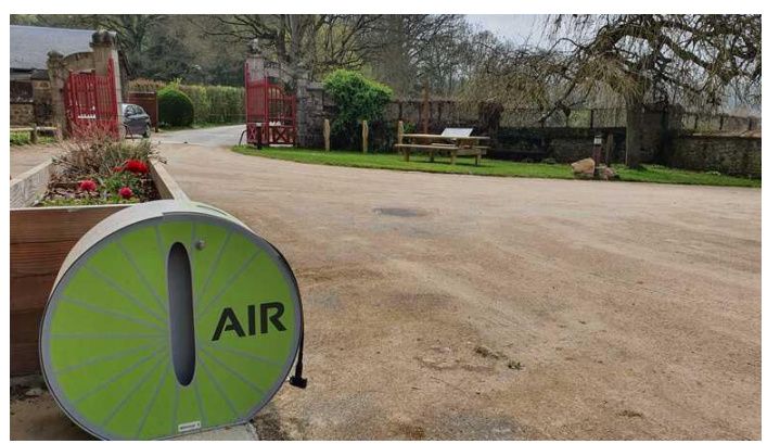
Tyre inflating pumps in Saint Léonard des Bois, © France Vélo Tourisme

Given the boom in the usage of e-bikes, rest areas on long-distance cycle routes should ideally offer charging stations as well. But seeing the risk of vandalism, the difficulty of having electricity in remote areas and the charging time, e-bike charging stations should be preferentially installed at accommodations or refreshment points (e.g. restaurants) where cyclists stop for a longer period and that are safer and easier to connect to electricity. Once again, cooperation with local businesses and actors is necessary to guarantee constant e-bike charging possibilities.