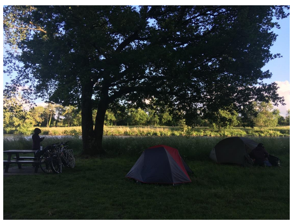
Rest area in Le Pellerin, France, along EuroVelo 1 – Atlantic Coast Route

Depending on the country's regulations regarding wild camping and bivouac areas, bikepackers could benefit from having an accessible green space to pitch their tent next to the rest area. These are especially recommended if the route section in question is far from urban areas and camping is the only possible accommodation type in the surroundings. If it is legally allowed in the country to wildcamp or bivouac in the area, there should be an information board making it clear to travellers, and giving them some recommendations (e.g. along the lines of the "Leave No Trace" principles). The Leave No Trace principles have been established with the idea to limit the impact of human recreational activities in natural areas. They include recommendations on waste disposal but also on topics such as wildfires, wildlife, surface durability, etc.