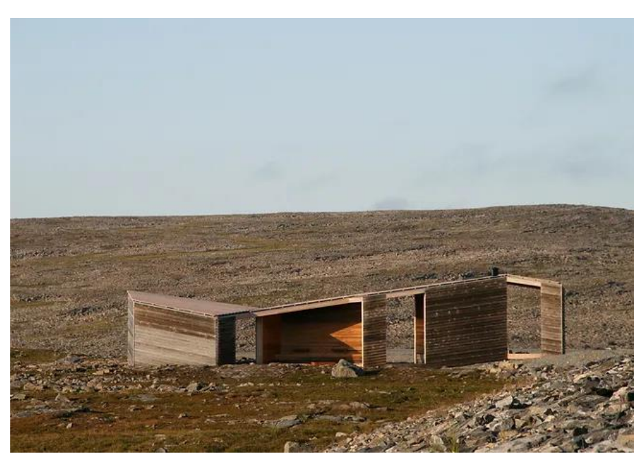
Rest area in in Reinoksvatnet, Norway © Pushak

As indicated on their website: "The rest area is located in a flat landscape at the top of a mountain pass and is very windy. Cosy sitting niches, fireplaces and toilets are baked together in an elongated volume, where the ceiling relates to the changing horizon, and the floor follows the terrain." These "niches" are also oriented in a manner to benefit in the best way possible from the view and the sun/midnight sun across the sky.<sup>1</sup>