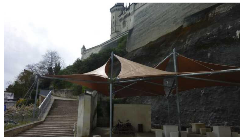
Rest area in Saumur, France, © France Vélo Tourisme

Group work, the creation of murals, mosaics, carvings and so on by community members and local schools, further enhances the local ownership, use, and respect of the rest areas. Signature art pieces also provide icons for the route and points of interest along the way, and can generate touristic interest (Greenways and Cycle Routes Ancillary Insfrastructure Guidelines).