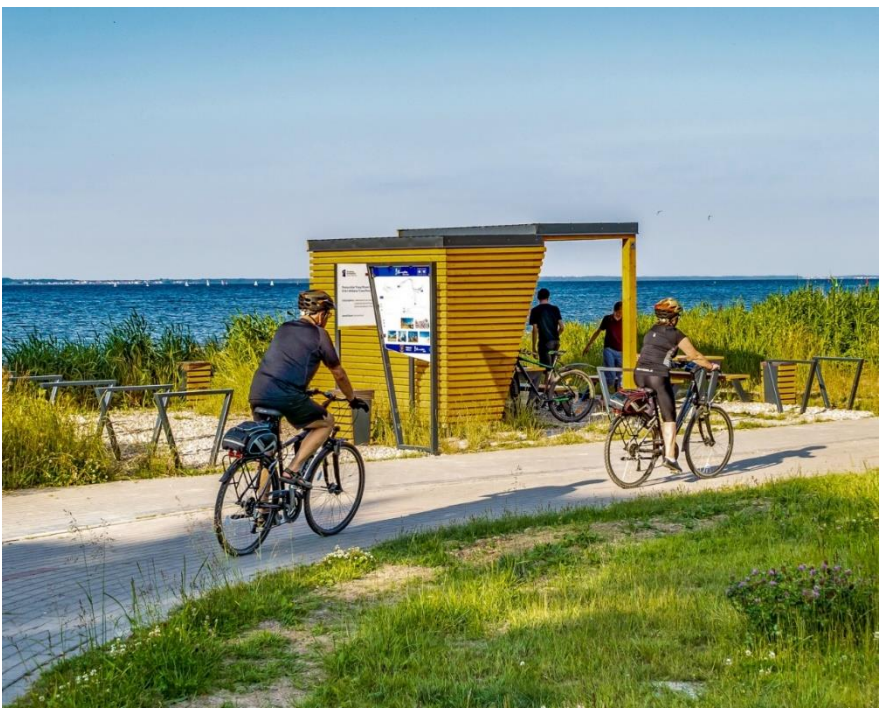
Rest area with many bike parking spaces along a common section of EuroVelo 10 – Baltic Sea Cycle Route and EuroVelo 13 – Iron Curtain Trail in Puck, Poland, © Pomorskie.travel

There should also be enough space between two racks to be able to easily move a bicycle around and potentially unload it, taking into account the likely presence of multiple bicycle bags.