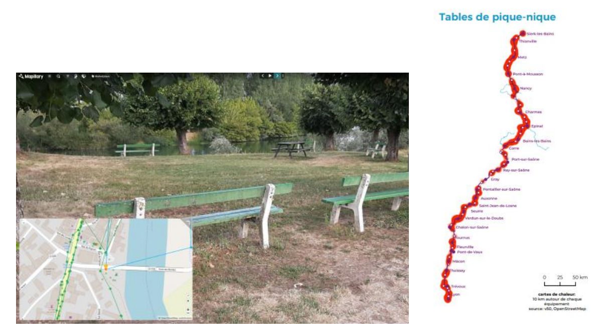
Screenshot of Mapillary and heat map of picnic tables © SuperVitus305 & Fractale | novembre 2020

Finally, they surveyed the route to check the accuracy of their data and complete it.