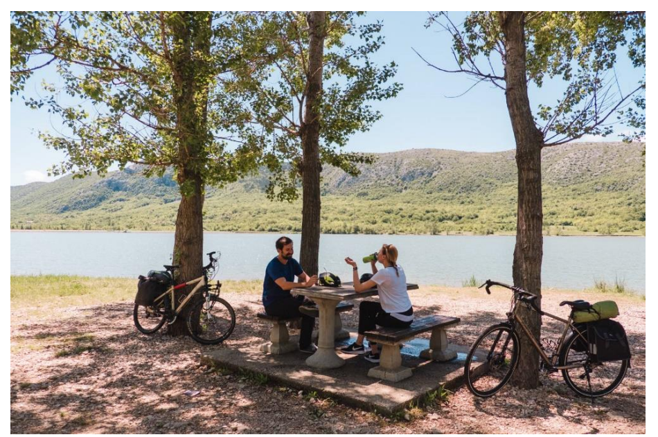
Rest area at Tribalj lake along EuroVelo 8 – Mediterranean Route in Croatia