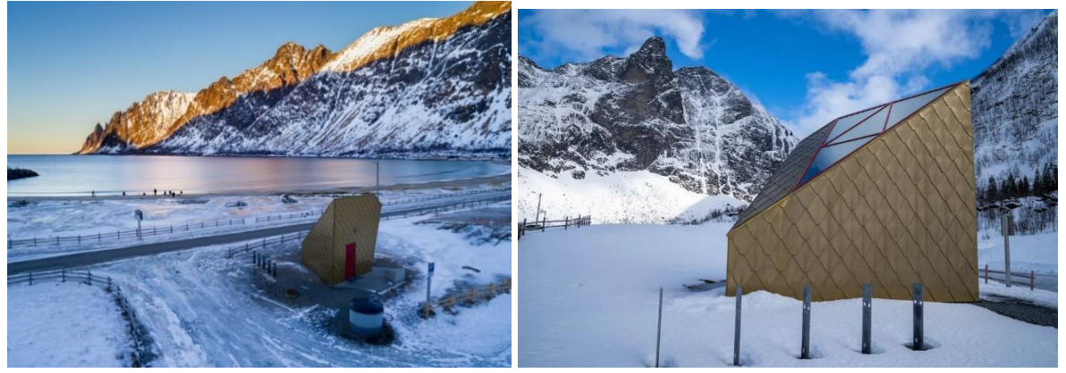
Rest Area in Ersfjordstranda, Norway, by archiecture agency Tupelo Arkitektur on Scenic Route Senja along EuroVelo 1 – Atlantic Coast Route