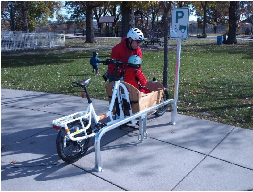
Cargo-bike parking, © Saris Infrastructure<sup>2</sup>

As EuroVelo 1, similarly to several EuroVelo routes, is also used by cyclists doing family trips and for daily use, cargo-bikes must be kept in mind. Indeed, cargo-bikes have specific needs in terms of parking as they are larger than a traditional bike. Therefore, they require longer bike racks and as their locking point is lower, the height of the stand must also be adapted. Offering a few cargo-bikes racks in rest areas can be very useful in addition to the traditional ones.