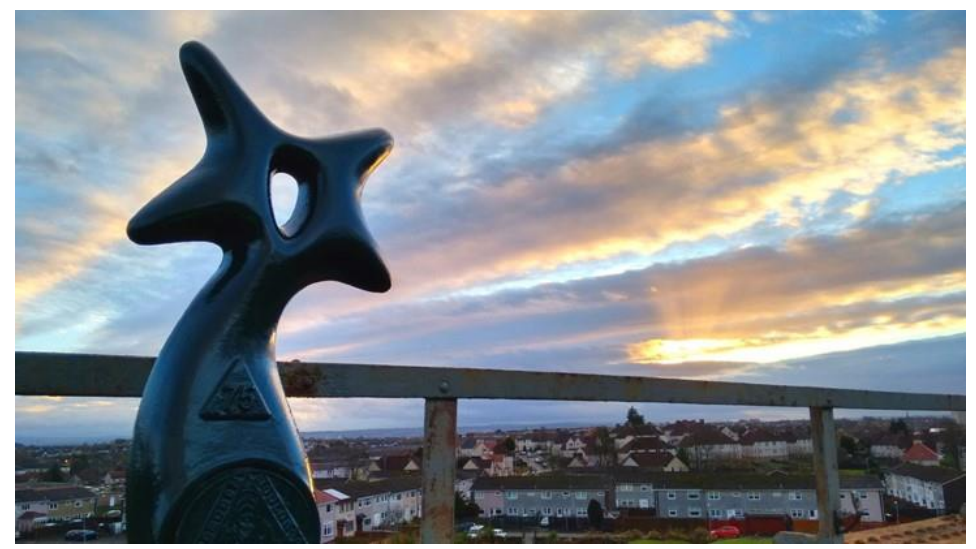
A Millennium Milepost designed by Ian McColl in Coatbridge, Scotland

The Millennium Mileposts are cast-iron sculptures that help navigate the National British Cycle Network. There are four different milepost designs as four artists from the four countries of the United Kingdom were commissioned by Sustrans to design these artworks. They embody the freedom and diversity of the National Cycle Network. Over 1,000 Millennium Mileposts have been installed across the UK since 2000. It is a great example of community engagement as volunteers were invited to help set up these Mileposts and, more recently, a collective audit<sup>6</sup> was initiated in the summer of 2021 to identify which Mileposts needed some fixes. Volunteers from Sustrans and local community groups took part in the general effort to refresh the paintings.<sup>7</sup>