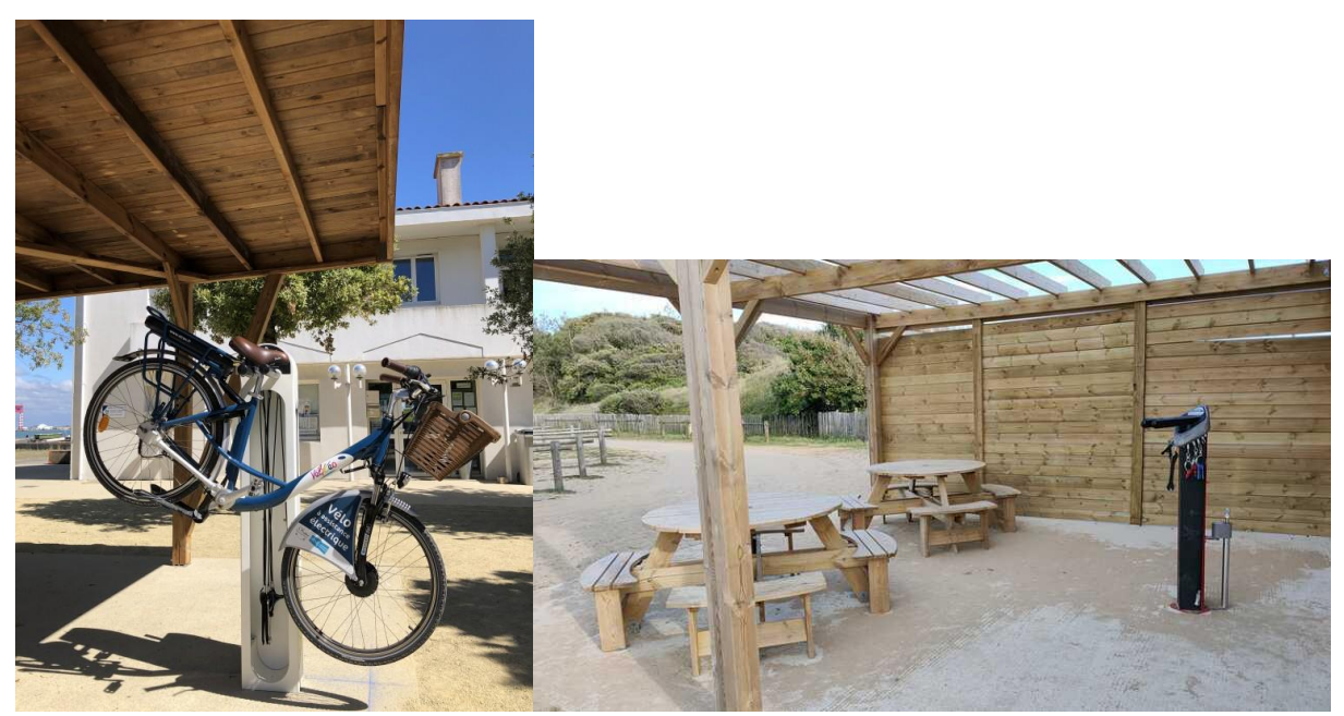
Rest areas equipped with repair kits in Saint-Brévins-les-Pins and Longeville-sur-Mer, France, along EuroVelo 1 – Atlantic Coast Route

If a rest area is located in a place where there are no bike repair shops nearby, it may be important to provide cycle tourists with a bike helpline, i.e. a designated phone number that a user can call to ask for assistance, and not only repair tools. Cycle tourists could be put in touch with someone able to provide them with guidance to repair their bike – a cycling-friendly local or national organisation, for example.