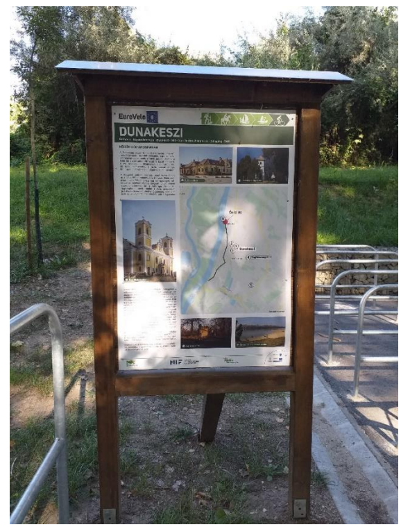
Information panel set in a rest area in Dunakeszi, Hungary, along EuroVelo 6 – Atlantic-Black Sea

The boards can also include digital features such as a QR code that link to websites with the most up-to-date information. This is useful in areas often afflicted with floods and fires that may lead to alternative itineraries. This limits the need to regularly update physical signs.