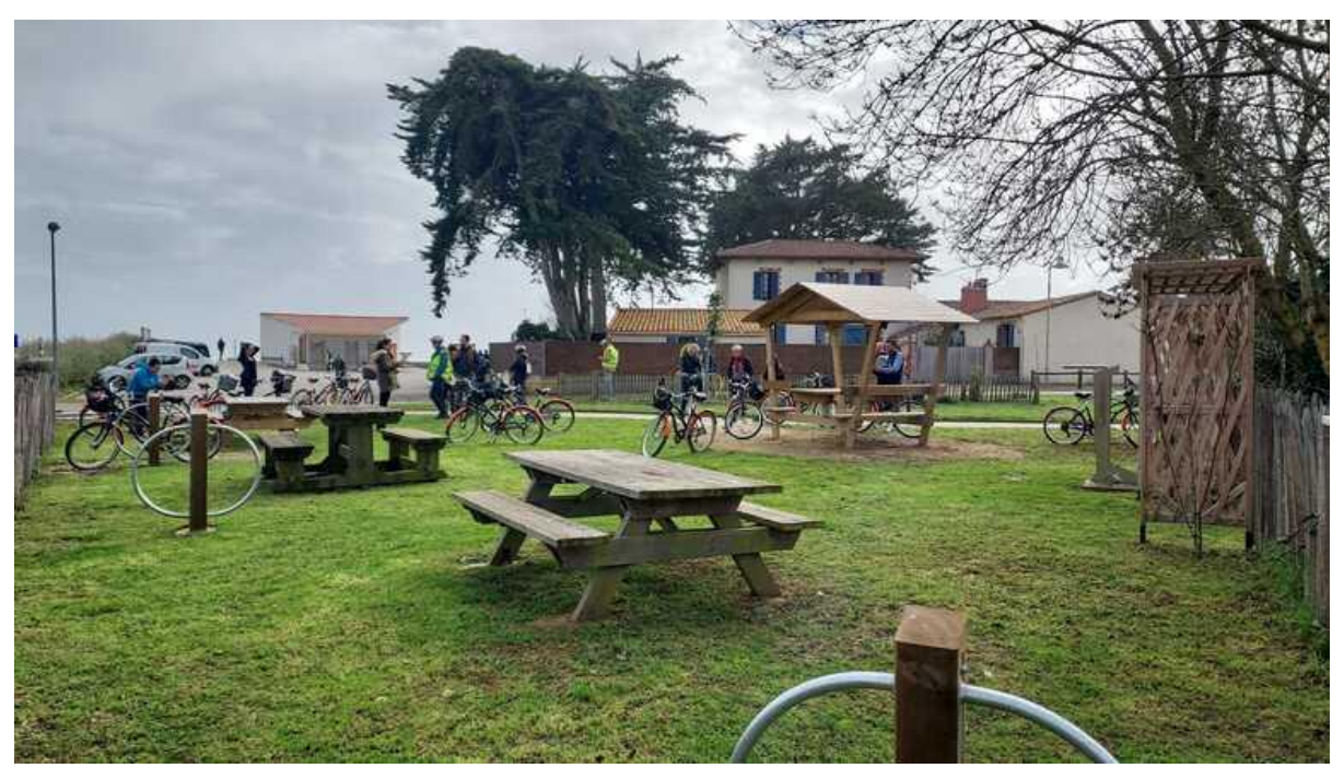
Good-quality bike racks in Le Goulet, France along EuroVelo 1 – Atlantic Coast Route