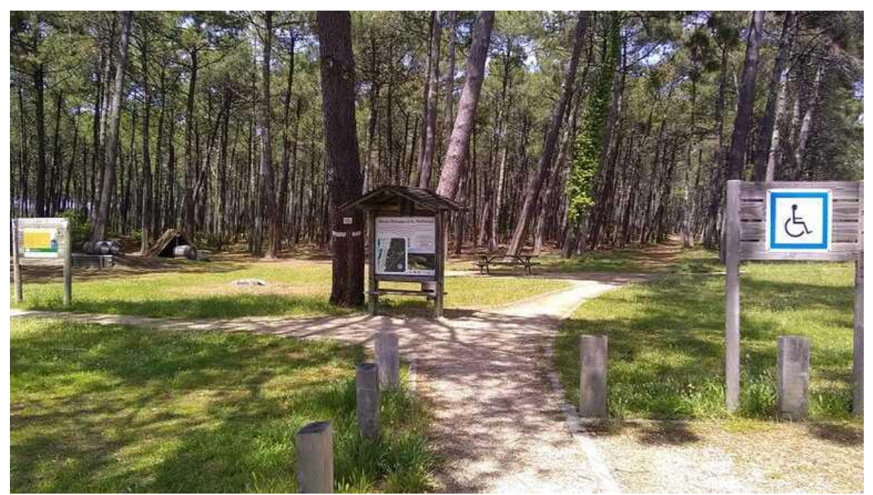
Service area in Mimizan, France along EuroVelo 1 – Atlantic Coast Route, © France Vélo Tourisme

As a principle, rest areas should be barrier-free – ensuring that bikes and bikers can access them. Infrastructure provisions for visually impaired people should be put in place when possible, including accessible toilets. The infrastructure should also be safe for children.