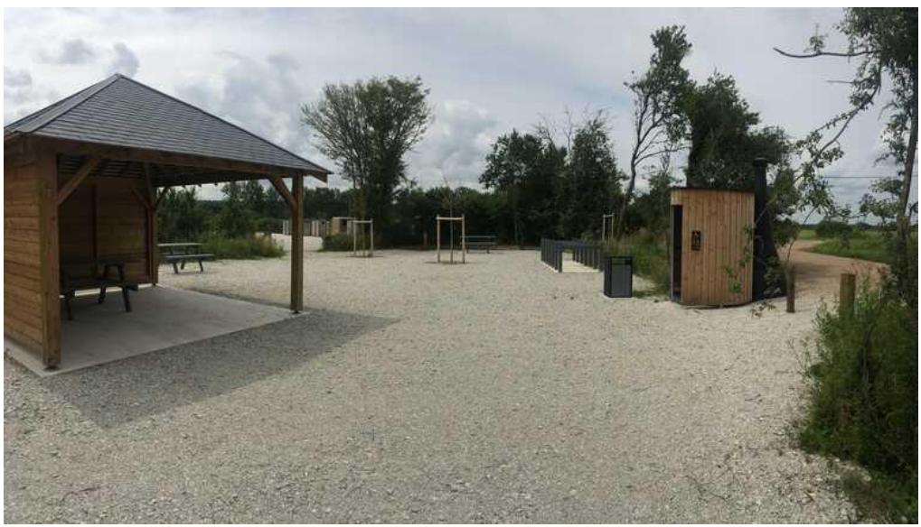
Rest area in Les-Ventes-de-Bourse, France

A shelter gives a temporary space for cyclists to recover and be protected from the rain or the sun, depending on the climate. In very sunny or rainy climates, it is even more important that shelters are a constant feature of rest areas, but they should be considered an essential feature anywhere.