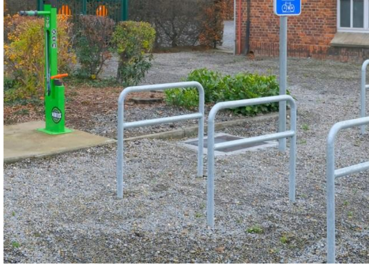
Bike racks in Belgium, © Pro Velo

The reverse U-shaped rack solution (with or without a crossbar) remains the most universal and most comfortable/safe option for cyclists. The racks can be adapted to a wide variety of bicycles (the intermediate crossbar allowing to lock children's bikes, bike trailers, handbikes, etc.).