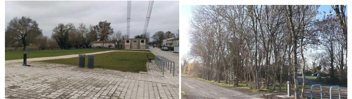
Waterpoints in Rochefort, France along EuroVelo 1 – Atlantic Coast Route and in Marans, France

If there is a need to set up a water point, it should be ensured to provide taps high enough to fill a water bottle. Taps with push buttons are to be favoured to limit water waste.