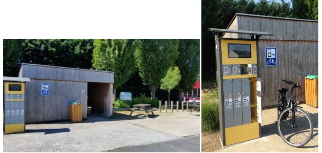
Charging station in Montjean sur Loire, France, along La Loire à Vélo, part of EuroVelo 6 – Atlantic – Black Sea

In France, an entity dedicated to energy distribution in the Maine-et-Loire department (Syndicat intercommunal d'énergies de Maine-et-Loire (Siéml)) started a network of 30 charging stations in partnership with cities, taking over between 25 and 75% of the costs of the station. The first station built is the one featured below, in Montjean sur Loire. It allows free battery charging through secure lockers with standard sockets near tourist attractions.<sup>5</sup>