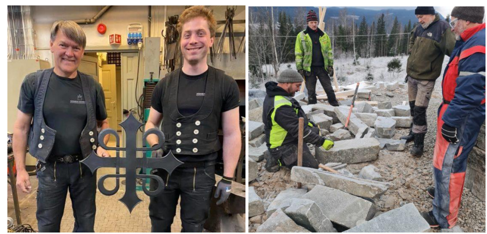
The blacksmiths of the cathedral and the handcrafted pilgrim symbol – Courses for the local community of old building-techniques

In order to have successful cooperation, the association started the discussions with the municipality and the land-owner very early on and they kept in mind that the rest area must be as much for the locals as for longdistance walking pilgrims. To better attract the attention of the locals, the organisation held courses on old building techniques, communicated about it to get local attention during the building process, and had big opening events.