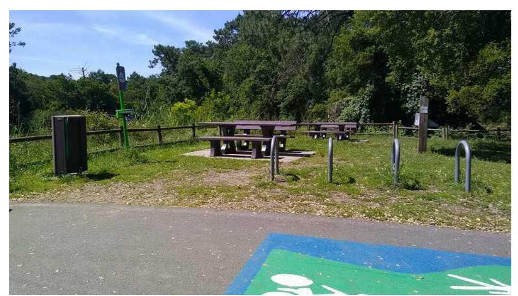
Picnic area of Capbreton, France, along EuroVelo 1 – Atlantic Coast Route

These and other non-essential services will be discussed in detail in the following sections.