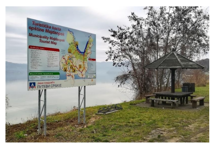
Rest area with a bilingual tourist map along EuroVelo 6 – Atlantic – Black Sea in Serbia © EuroVelo

Panel with pictograms of the services of the next rest area along EuroVelo 7 - Sun Route in Czechia © EuroVelo