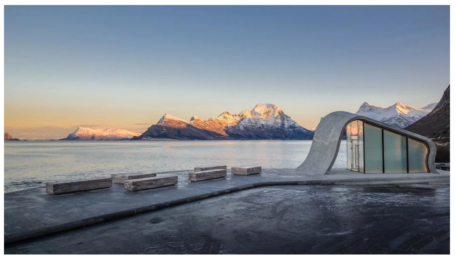
Rest Area in Ureddplassen, Norway, by architecture agency Haugen/Zohar Arkitekter on the Scenic Route Helgelandskysten along EuroVelo 1 – Atlantic Coast Route

Moreover, their marketing strategy was well-thought out with a website with impressive pictures and videos, an original concept and promotion through international articles.<sup>10</sup>