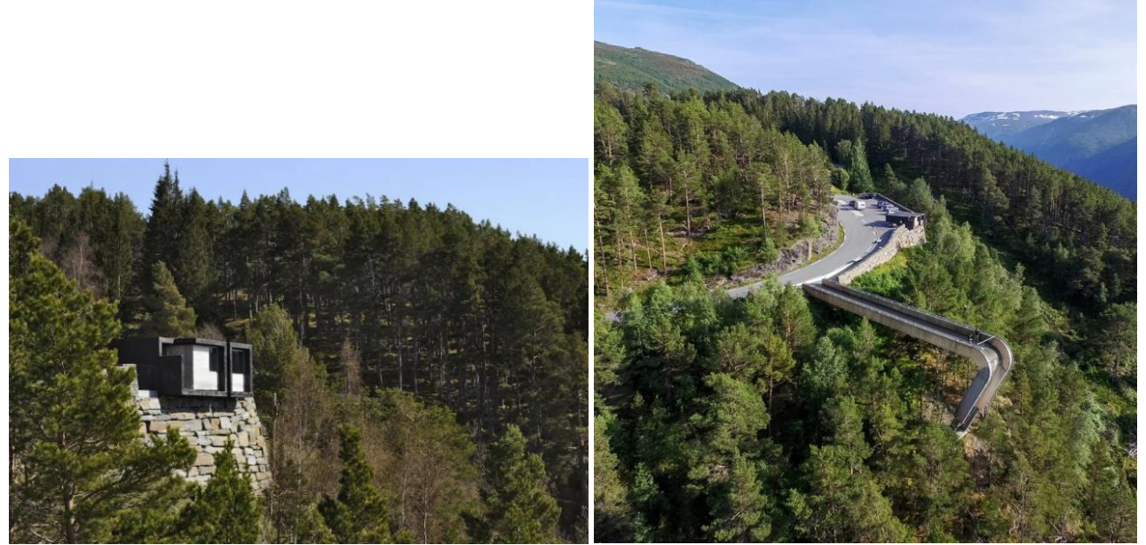
Rest area by architects Todd Saunders og Tommie Wilhelmsen in Stegastein, Norway, along the Scenic Route Aurlandsfjellet © Jarle Waehler for Statens vegvesen (picture 1) and © Kjetil Rolseth (picture 2)