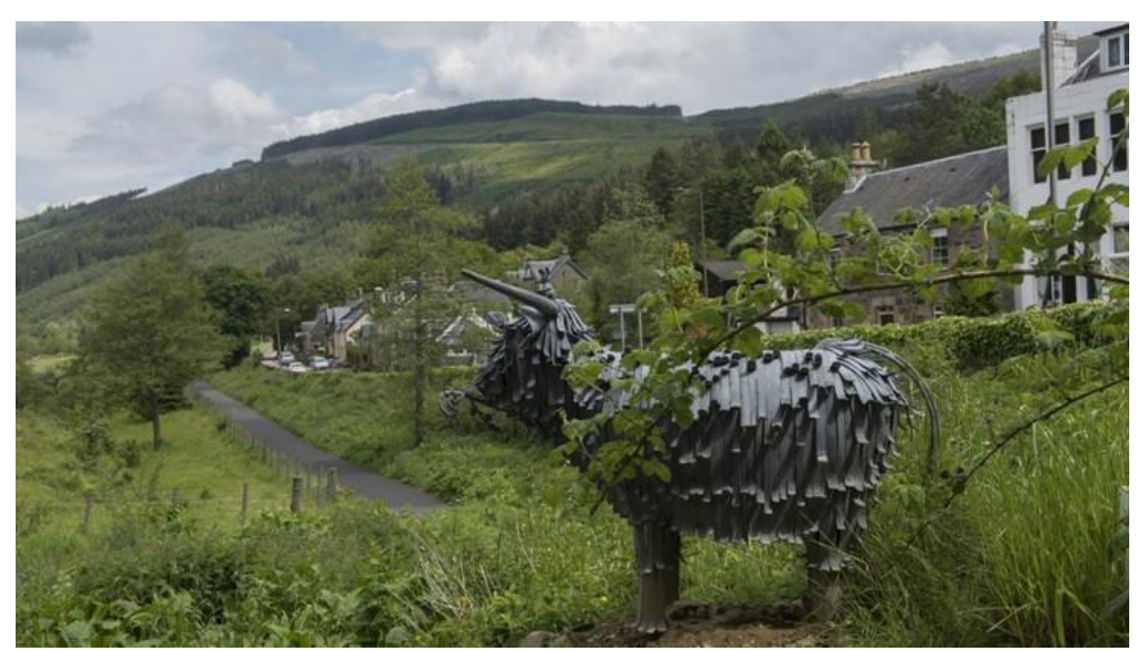
Drover's Bho in Strathyre, on the itinerary of EuroVelo 1 – Atlantic Coast Route

Land art is an element that can be added to rest areas, as well as to cycle routes in general. This term defines art made with natural materials such as earth, rock or vegetation, that can be found in nature. Telling a story or adding an artistic element to an otherwise monotonous cycle route can help make the trip a unique and memorable experience, as well as fit the landscape. The examples of land art on EuroVelo cycling routes are plenty – more information on the <u>EuroVelo website</u>.