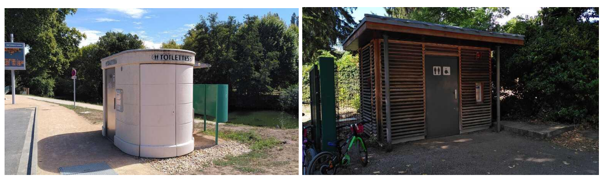
Automatic toilets in Thoissey and Trévoux, France, © France Vélo Tourisme