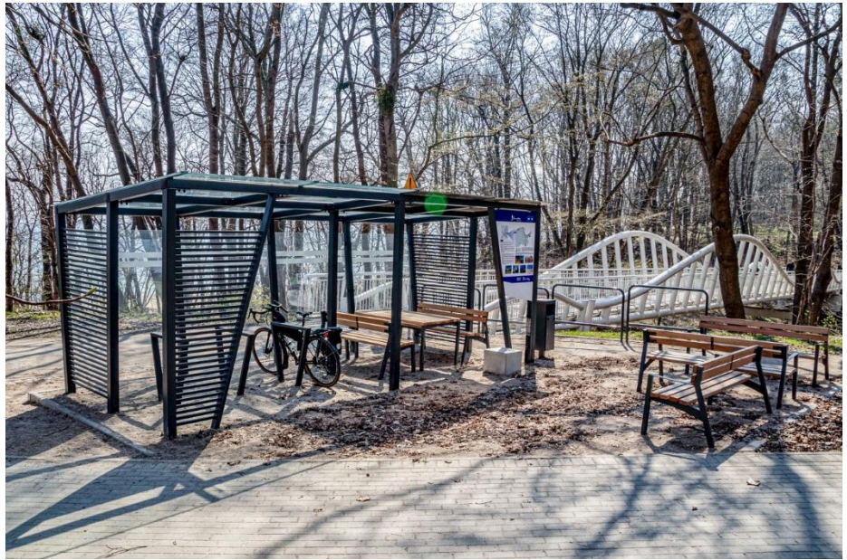
Rest area with benches and covered picnic table along a common section of EuroVelo 10 – Baltic Sea Cycle Route and EuroVelo 13 – Iron Curtain Trail in Gdynia, Kolibk, Poland