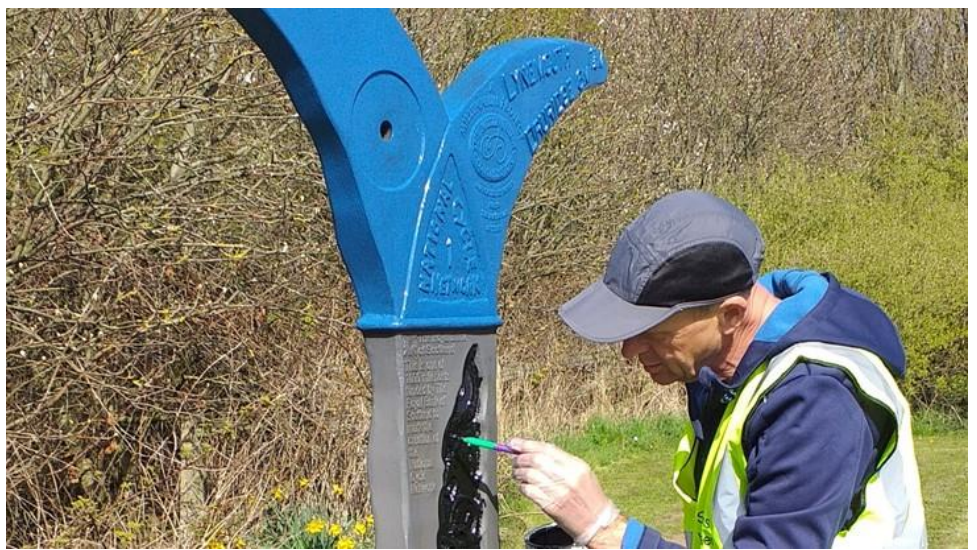
A volunteer repainting a Milepost in Lynemouth, Northumberland