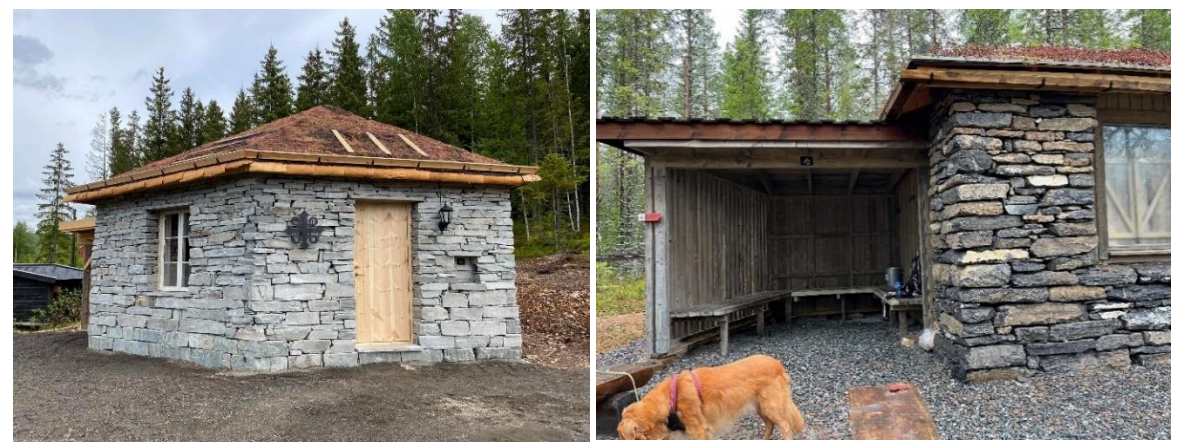
Rest area on Saint Olav Ways in Øyer, Norway © National Pilgrim Center, Association for the Cultural Route of St. Olav Ways<sup>9</sup>

These two rest areas were built with sustainable and local materials using local stone and an old handicraft technique of dry masonry construction (laying the stones dry by hand), this project was led by The Association for the Cultural Route of St. Olav Ways. The rest of the cabin was built with local and short-travelled wood, and when possible it was re-used wood from other buildings. The association also used biological sedum mats on the roof as this rooted plant allows reduced maintenance (by absorbing rainwater,