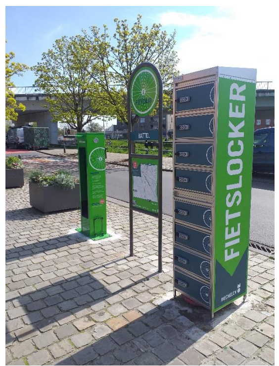
Bike lockers allowing for the safe storage of bicycle bags, along the Art Cities Route in Mechelen, Flanders

Lockers for bikes and luggage are also an important feature, especially in the vicinity of tourist attractions that cyclists cannot access by bike. A bike locker should have space for the bike and for luggage to store them both safely.