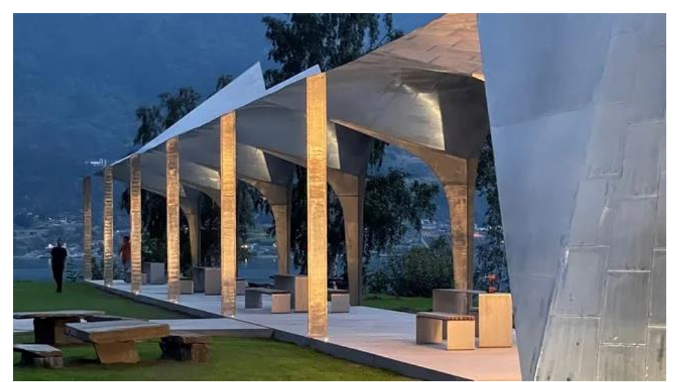
Rest area in Espenes, Norway, by the architecture agency Code Arkitektur along the Norwegian Scenic Route Hardanger.